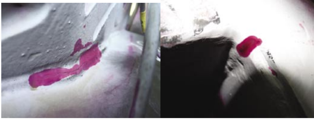
Fig. 6. Examples of joint penetrant testing results – welding imperfections in the form of cracks