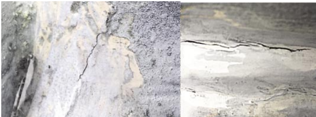
Fig. 7. Examples of joint MT results – welding imperfections in the form of cracks

Magnetic particle testing (MT) consists in detecting defects in ferromagnetic materials with the use of magnetic field. Magnetic field is dissipated when defects are encountered. The lines of magnetic field are visualised by means of a ferromagnetic powder material. This method is used to detect both surface defects as well as slightly subsurface defects. The procedure of a magnetic particle test includes the following steps: Surface preparation - cleaning and demagnetizing the tested part, magnetizing, applying magnetic powder, visual inspection and registering the results, demagnetizing and surface cleaning.