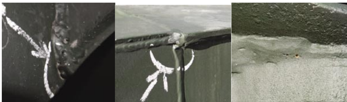
Fig. 5. Joint defects detected using VT – imperfect shape and dimensions, cavities, lack of fusion and penetration

Visual testing VT is the basic and most common type of non-destructive testing. This method is used to inspect welded joints with the naked eye; optical instruments with a magnification of up to 20x can be used. This method is often used to indicate areas to be tested using more advanced methods. The tested area must be cleaned mechanically or chemically to reveal possible surface defects hidden under the fouling. The tested area should be properly illuminated to attain appropriate contrast and light intensity. Contrast depends on the light incidence angle and on the angle of observation. Light intensity should be at least 350 lx; usually the light used has 500 to 1000 lx.