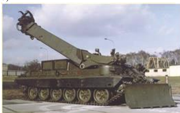
Fig. 3. Extendable crane section of MID Engineering and Road Vehicle

a) view of welded joints; b) machine/device (view)