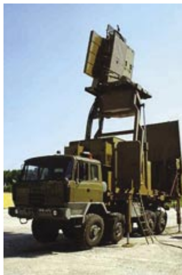
Fig. 1. Fragment of supporting framework of JBR-15 radar station

a) view of welded joints; b) machine/device (view)