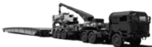
Fig 1. MS-40 portable bridge – bridge launching vehicle

The design and construction of the Z10 crane was based on OBRUM's experience in designing similar systems used in military vehicles (e.g. recovery vehicle) [1] [2].